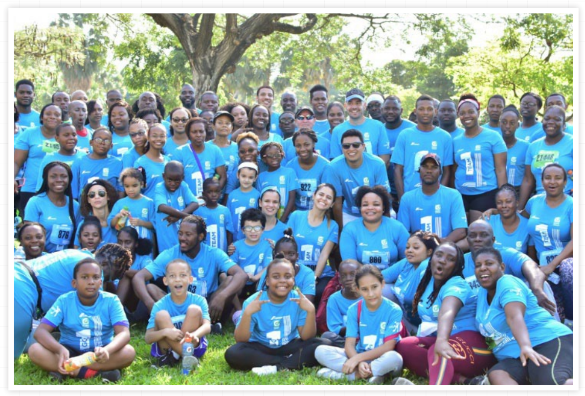
The Carib Cement Team at the Sagicor Sigma Corporate Run in January of 2020.